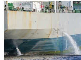
Ballast water disinfection