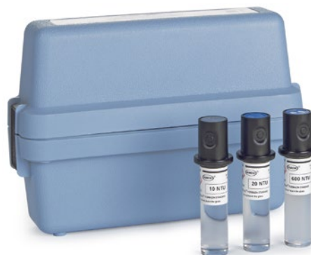
TU5 Calibration Vials

To maintain the 150 measuring points, staff carried out a scheduled cleaning, maintenance, and calibration service using a van equipped with spare parts, reagents and calibration standards. The maintenance and calibration were quantified at 4.5 hrs./instrument/year – not including nonroutine maintenance.