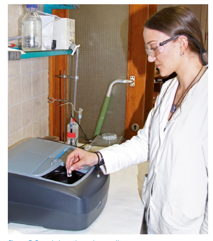
Figure 3: Sample insertion using a cell