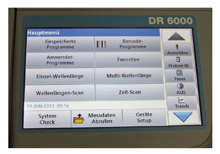
Touch screen with clearly structured user interface

It is not only the barcode detection of round cells that enables faster sample processing, but also the RFID module. This technology not only makes it possible to identify the user using a RFID user transponder on the device; RFID transponders can also be used to identify the samples. This firstly rules out sample mix-ups and secondly facilitates or ensures tracebility. The table on page 2 shows the technical data for the photometer.